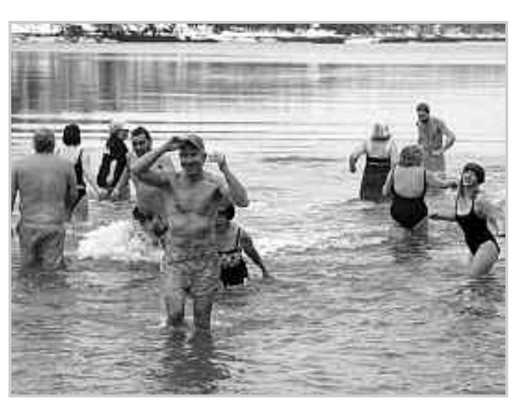
Hardy souls brave the cold water at Shoal Cove for New Year's Day dip.

had to run quite a ways though ankle-deep water before they could take a dive. Despite that, a few hardy souls even went in twice. So much for sanity. Survivors and onlookers convened afterwards at the Van Orden house for a potluck lunch of hot soups. homemade breads and sweets.