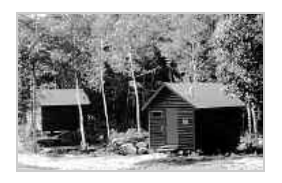
The Out Post outhouses (and changing rooms) at Houghton Pond.

West Bath Historical Society PO Box 394 Bath, Maine 04530